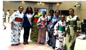
Japanese cultural experience for Sri Lankan students

We receive visitors from abroad and hold mutual visits to support exchanges across borders.