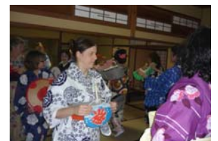
Bon dance wearing yukata (light cotton kimono)