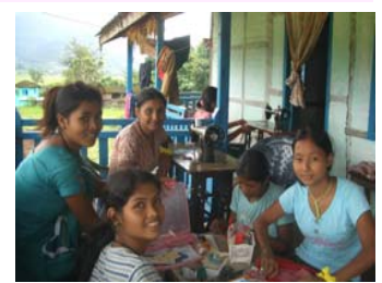
Big girls are working with sewing machine