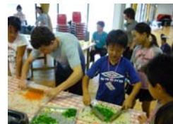
Boys and Girls enjoyed cooking their own international lunch. It was very delicious!