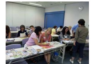
at Japanese class

Last year TIFA members visited Vermont and interacted with some teachers, and then a new group of teachers came to Toyonaka this year. TIFA members provided them the best possible programs including home stay, traditional culture workshops (such as Japanese cooking, Japanese calligraphy, the tea ceremony, flower arrangement, Origami, Japanese dance, and tsgaru-shamisen), and had a party to deepen our friendship. It is important to be exposed to each other's culture and promote a better understanding, especially in this complicated world. "Let's build a peaceful world by personal contacts on a grass-roots level!" We said goodbye, shaking hands with each other.