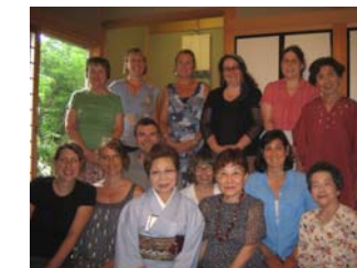
After the tea ceremony