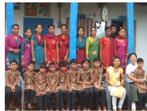
Happy Girls Home (Girls' orphanage in Nepal)

Please give your support to the women and children in Nepal! Your membership fee and donations will be used for the management of Happy Girls' Home, their scholarship, and to support the women to be independent. Please support us so that we will be able to continue these activities. Supportive Group for TIFA Nepal Project Annual fee : ¥ 5000 or more Your donations will be appreciated anytime. For details, please contact TIFA Office.