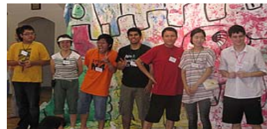
This year, leaders were from Vietnam, China, Inner Mongolia, Germany, Thailand, Peru, Korea, Afghanistan, Brazil, Guatemala, and Malaysia!

80 children attended the 4 th TIFA International Kids Camp this year and spent 2 nights-3 days with leaders from all over the world. There were 5 groups. This year junior high school group was established to provide more attractive and challenging programs for each age group. Junior High school kids learned more about foreign cultures, and sometimes supported program leaders as assistants. Younger kids respected them. It was extremely hot and TIFA member spent most of the time providing liquids. We have already started talking about the next year's program.