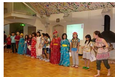
Children wearing Inner Mongolian costumes. At "Okunijiman" children sang, danced and showed what they had learned from their group leaders.

<TIFA International Kid's Camp was funded by "National Institution for Youth Education, Children's Dream Fund">