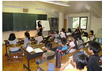
Children listening to a lecture about Afghanistan with great interest