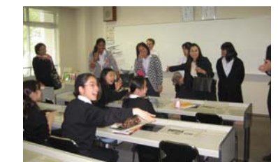
Thai students visited Baika high school