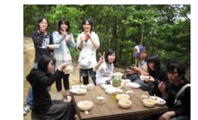
At the camp site